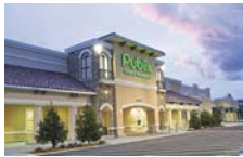
Publix Super Markets