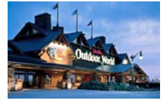
Bass Pro Shop