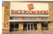
Rack Room Shoes