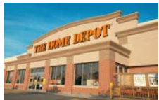
The Home Depot