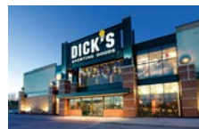
Dick's Sporting Goods