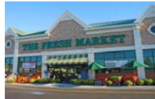
The Fresh Market