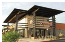
Chipotle Mexican Grill