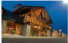
Field & Stream