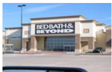
Bed Bath & Beyond